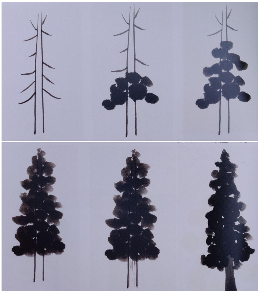
(3) Himalayan cedar ( Cedr himálajský )